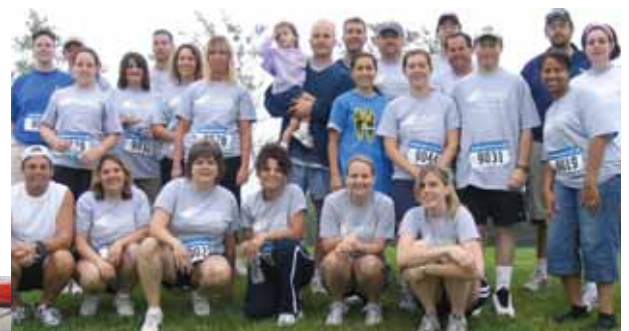
(Above) 28 Summit Employees participated in the Corporate Challenge at RIT.