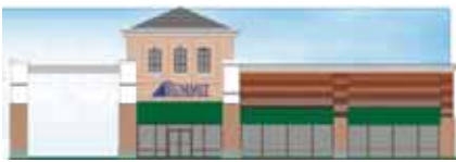
City of Buffalo branch drawing.

We are anxiously awaiting the completion of our second full-service branch in the Buffalo area to be located this time in the City of Buffalo. This new branch will be in a newly built plaza at the corner of Delaware Ave. and Hertel Ave., and it won't be far from the site of our original branch at 2727 Main St., the former branch of the Buffalo Telephone Employees Federal Credit Union. This new facility will feature a drive-up ATM and teller lane, and should be very easy to reach for our Buffalo members who live or work in the downtown or surrounding areas. We are looking at a tentative Grand Opening date in November and will provide more definite details as we move through the Fall.