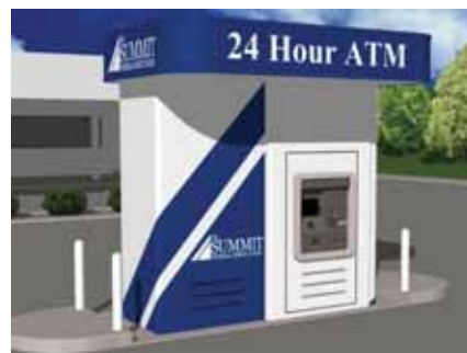
New Hilton ATM Kiosk

Our new Hilton ATM adds to the credit union's list of over 120 surcharge-free ATM's available for Summit members in the Western NY and Finger Lakes areas. The new ATM is open 24 hours and is located in a safe, well-lit and easily accessible area near the branch.