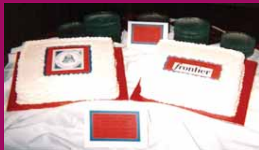
The Summit recently celebrated with Frontier retirees.

The Summit was proud to take part in a special celebration of retirees at Frontier Corporation in Rochester recently. The company recognized all of their employees who were about to retire by having a luncheon at the Strathallan Hotel.