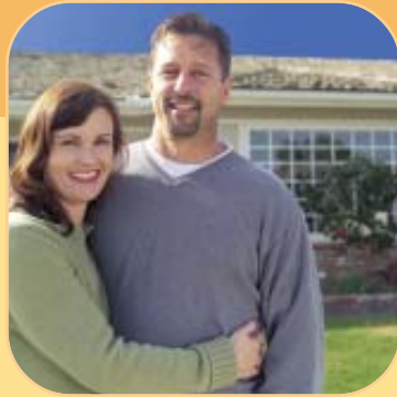
BUYING A HOUSE?