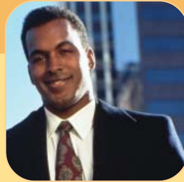
STARTING A NEW JOB?