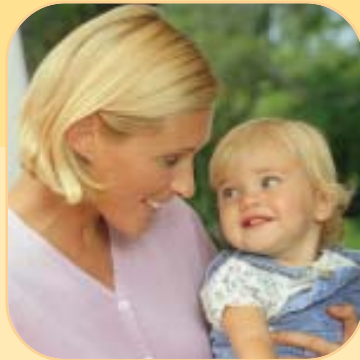
HAVING A BABY?

"You owe it to yourself and your family to know all your options. There is no cost or obligation to talk with a financial professional."