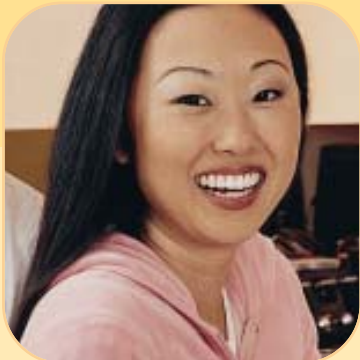
STARTING YOUR OWN BUSINESS?